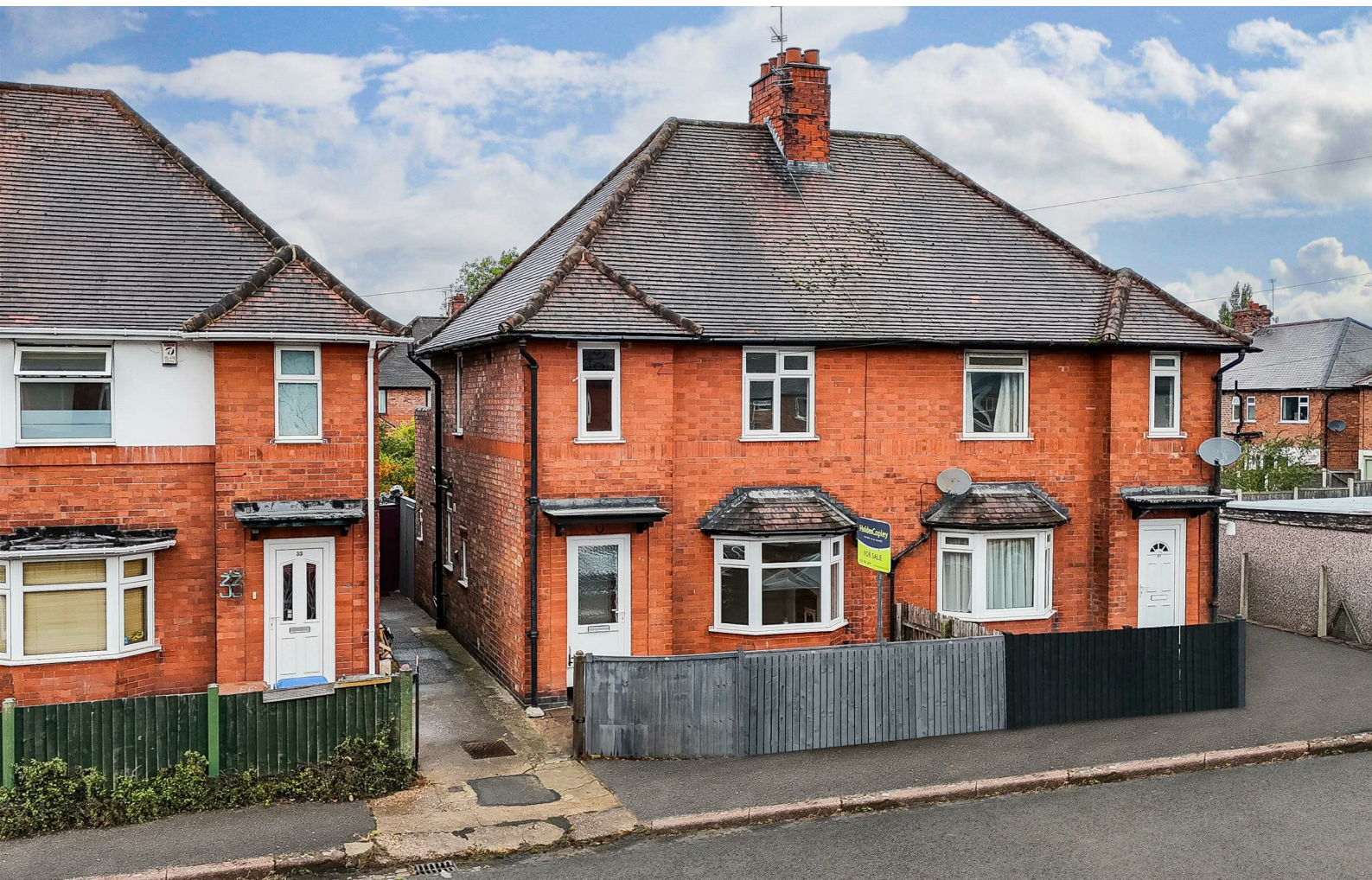
George Avenue, Long Eaton, Derbyshire NG10 2BP